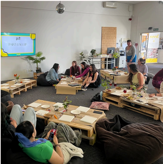
Hive 11 provided space for a vast array of kaupapa, including political, environmental, cultural, and social initiatives—demonstrating broad and deep community integration.

From the very beginning, the Hive 11 team has gone above and beyond to ensure that every workshop and hui runs smoothly. Their warmth, professionalism, and attention to detail have created a welcoming environment where everyone feels valued and supported. The venue itself is exceptional — spacious, modern, and incredibly user-friendly. It’s equipped with everything we’ve needed for our Waikato Local Network gatherings and Civics Education workshops, and our attendees have consistently commented on how comfortable and engaging the space is. — Taurikura NZ