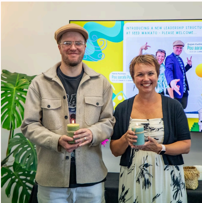
The dual leadership approach , initially met with skepticism, has modelled alternative power structures, directly benefiting both organisational sustainability and staff empowerment. [