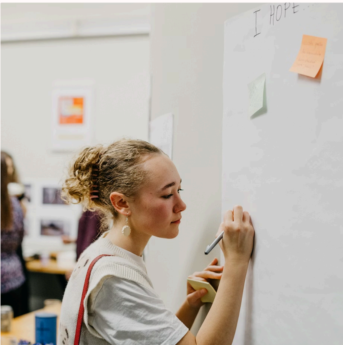
Deep leadership pathways are illustrated by young leaders joining Seed Waikato’s board after journeying with the organisation, showing the ripple effect of the internal culture. [