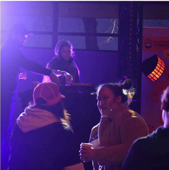
Early morning raves inspired youth to enrol and engage in voting, with high online engagement and visible mindset shifts in participants evangelising the movement among their peers. [